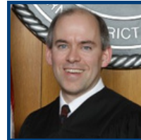
Hon. Sean H. Lane U.S. Bankruptcy Court USA