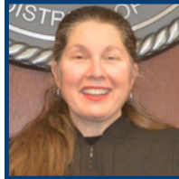
Hon. Lisa G. Beckerman U.S. Bankruptcy Court USA